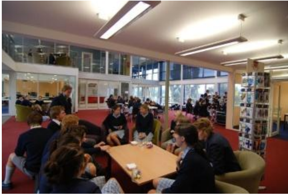
Scotch Oakburn College Students