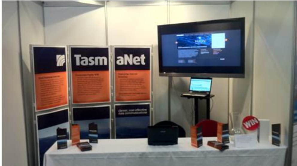
The TasmaNet booth at the kanz broadband summit